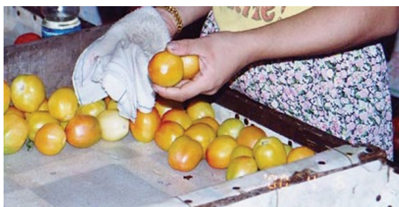
Photo 11. Wiping of tomatoes with moist clean cloth