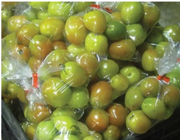
Photo 26. Tomatoes in retail packs (in supermarkets) and in retail display in wet markets