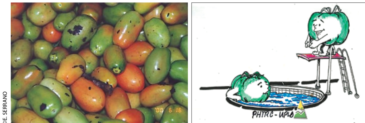
Photo 10. Newly harvested dirty tomatoes should be washed in chlorinated water

Tomatoes can also be cleaned by wiping them with moist cloth (Photo 11). Insure however, that the water and the cloth used in wiping the fruit are clean to prevent contaminating the fruit.