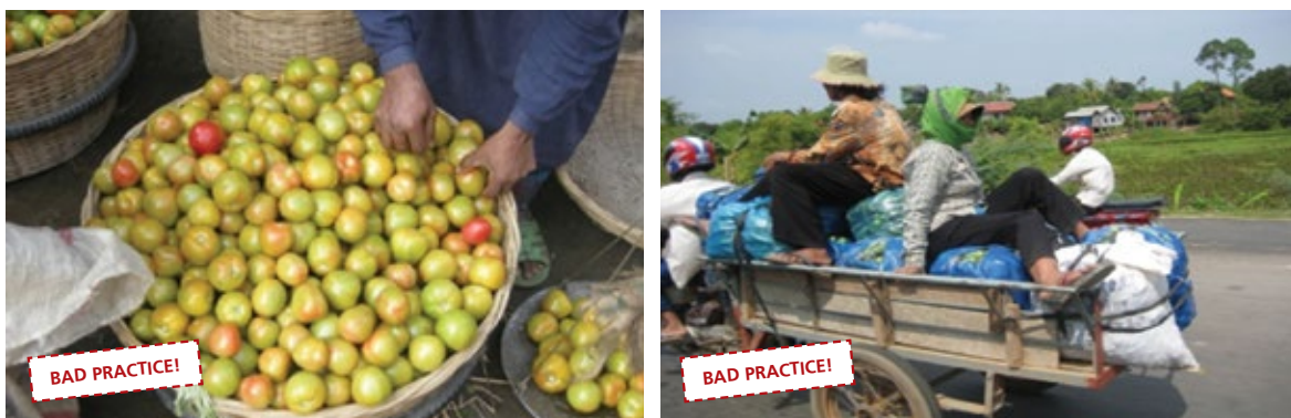
Photo 5. Improper handling like packing in bamboo baskets and sitting on packed tomatoes during transport lead to damage on the fruits

Tomatoes are also susceptible to attack of insects and decay-causing organisms which can eventually result in faster deterioration. Rough handling may create wounds which serve as entry points for decay-causing organisms. Wounds are also avenues for water loss and can speed up the ripening process.