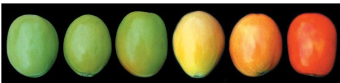
Photo 3. Programed change in tomato like ripening

Tomato fruits consist mainly of water and when harvested, it can no longer replace the water that is lost. Conditions like high temperature and low relative humidity result in water loss hence the loss in marketable weight. Water loss from the fruit results also in shriveling (Photo 4). Exposing fruit to the sun results in rapid water loss.