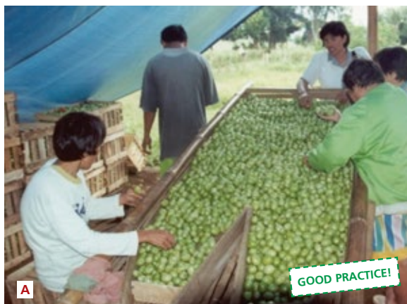
Photo 14. Sorting of tomatoes using a sorting table (a) which is good practice, and sorting on the ground (b) which may lead to microbial contamination