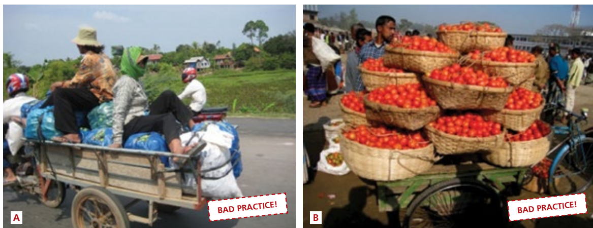
Photo 21. Bad practices during the different transport stages of tomato: (a) farm to collection center with farmers sitting on packed tomatoes and (b) collection center to wholesale market