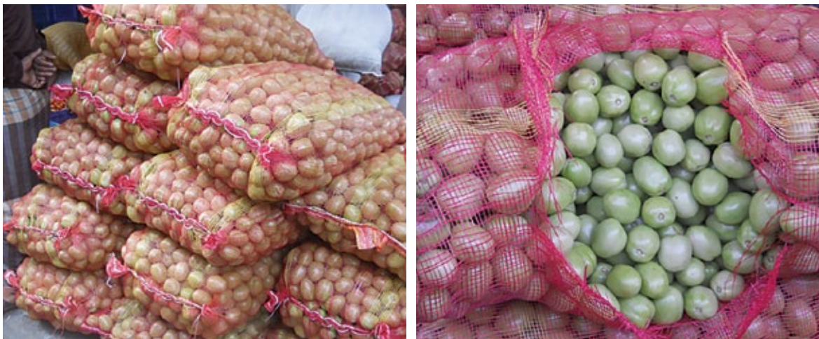
Photo 18. Injuries in the form of breaks in the skin and compressed areas due to poor packaging