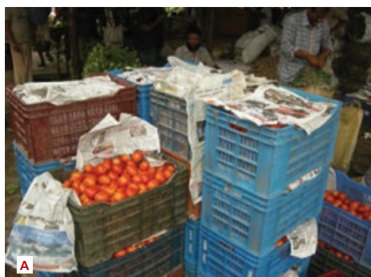
Photo 25. Tomatoes packed in plastic crates and kept in clean wholesale stall (a), and tomatoes in plastic crates placed near culls and wastes (b)