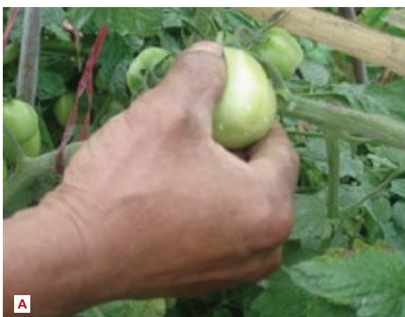
Photo 8. Hand-picking of tomato fruit (a), and use of gloves during harvesting prevents damage on the fruit (b)

The fruit should be handled carefully during harvesting. Practices like throwing tomatoes into the container, dropping and dragging of containers during hauling causing fruits to bump against each other must be prevented. These poor handling practices will result in both visible and non-visible damages like internal bruising. Visible injuries can be in the form of cuts, punctures or abrasion. Internal damage will appear later as brown or black discoloration in the seed area or manifested as faster ripening and increased susceptibility to decay.