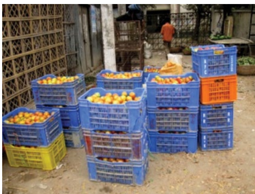
Photo 15. Tomatoes packed in rigid plastic crates thus providing adequate protection to its contents

Plastic bags, plastic sack and red mesh bags do not provide adequate protection to the contents (Photo 17). They are readily damaged and will lead to fruit deterioration. Injuries often incurred include compression manifested as flattened areas and breaks in the skin (Photo 18).