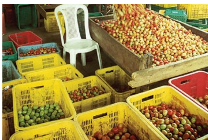
Photo 24. Re-sorting of tomatoes in the wholesale market