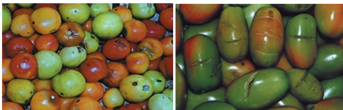
Photo 1. Nature of losses in tomato: decay, over-ripening and mechanical damage

With changing consumer tastes and lifestyles and the continuous growth of supermarkets and the demands from institutional buyers, more attention in post-harvest handling of tomato to satisfy their demand for better quality (Photo 2) and safe produce.