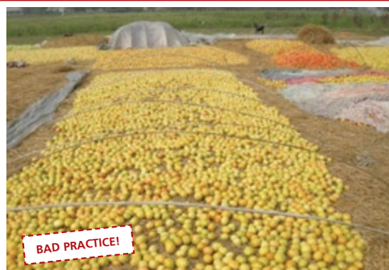
Photo 7. Exposure of newly harvested tomatoes will result in heat build-up and accelerated ripening