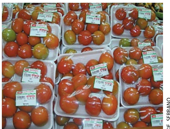
Photo 2. Good quality tomatoes are required by institutional buyers like supermarkets