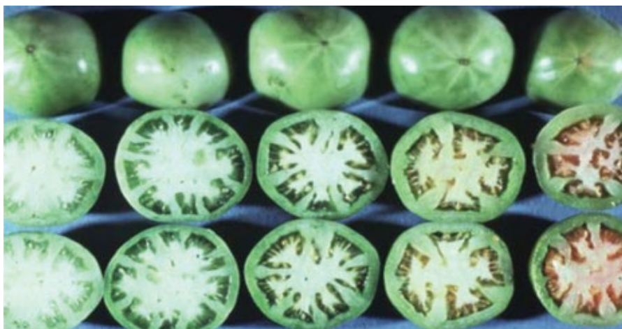
Photo 6. External and internal appearance of mature green tomatoes

Pick tomatoes during the cooler part of the day. It is recommended to harvest up to noontime and to keep the harvested fruits in a shaded area soon after picking. A rise in fruit temperature occurs when the fruits are left exposed to the sun (Photo 7). Heating up will result in accelerated ripening of fruits.